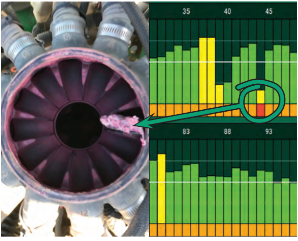
A dead mouse partially blocking a secondary. The mouse clearly had more than his share of seed treatment. With SeederForce you can catch these issues the moment they happen on the 20|20®.