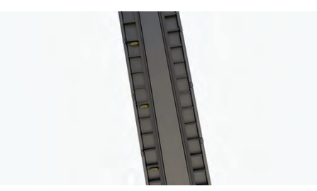
The belt controls the seed down the tube eliminating seed bounce and row unit ride issues.