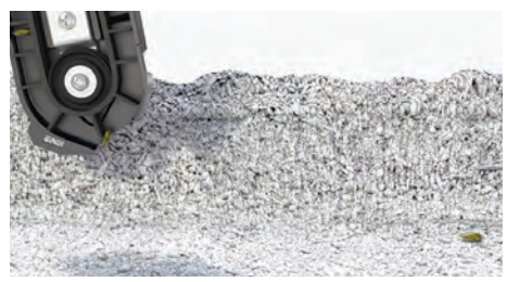
The belt matches the speed of the planter and drops the seed exactly where it needs to be as